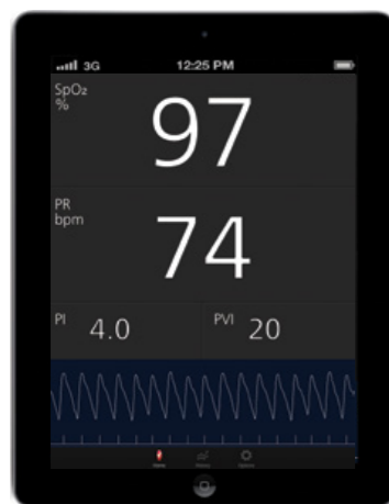
VIEW measurements on compatible smart device*

Display parameter data to a compatible smart device with Bluetooth® LE enabled models. Measurements can also integrate into Apple's Health app.**