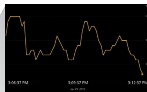
Example of data trend over 6 minutes

* The app is downloadable from the App store™ for iOS devices or Google Play™ store for select Android devices. For an up-to-date list of compatible smart devices, see: www.masimoprofessionalhealth.co.uk